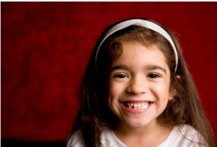
A girl lights up a smile for Children's Day in Mexico

On Sunday, April 30, you are invited to celebrate Children's Day ( El Día Del Niño ) at Iglesia Luterana Santa Cruz in Santa Maria. El Día Del Niño is celebrated as a tribute to children in Mexico each year, which is a national day of observance.