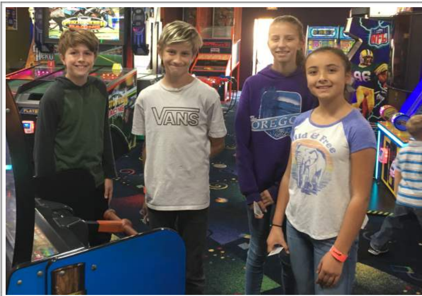
Youth at Boomers