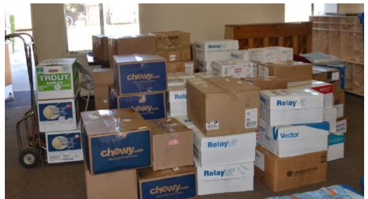
71 boxes of supplies from Bethania and Hope, Atascadero

Besides quilts, school kits, and nursery kits, Lutheran World Relief also is able to help with other needs for people struggling with daily survival. One such area is Syria. LWR has worked to help repair and renovate bakeries in two areas of the Aleppo district. Those bakeries will provide affordable, daily bread to more than 80,000 people.