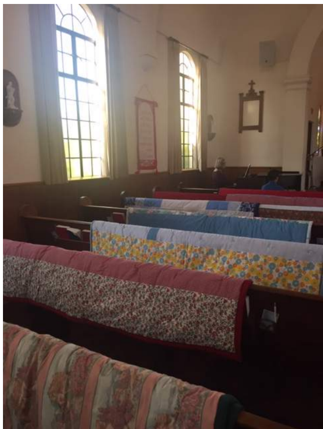
Quilts in Church Before Being Packed for Lutheran World Relief