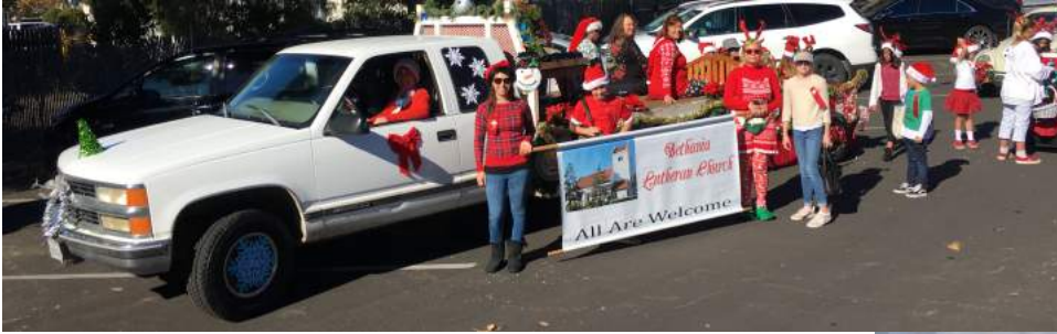
Christmas Parade, left Iglesia Presents, below