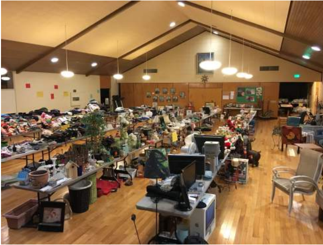
With Hopes of Returning in January 2020 - Rummage Sale