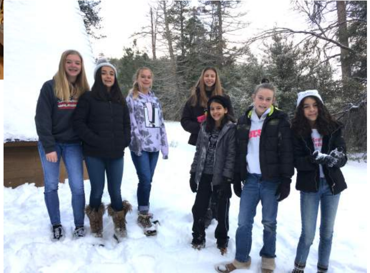
With hopes of Returning in February/March 2020 - Youth Winter Retreat